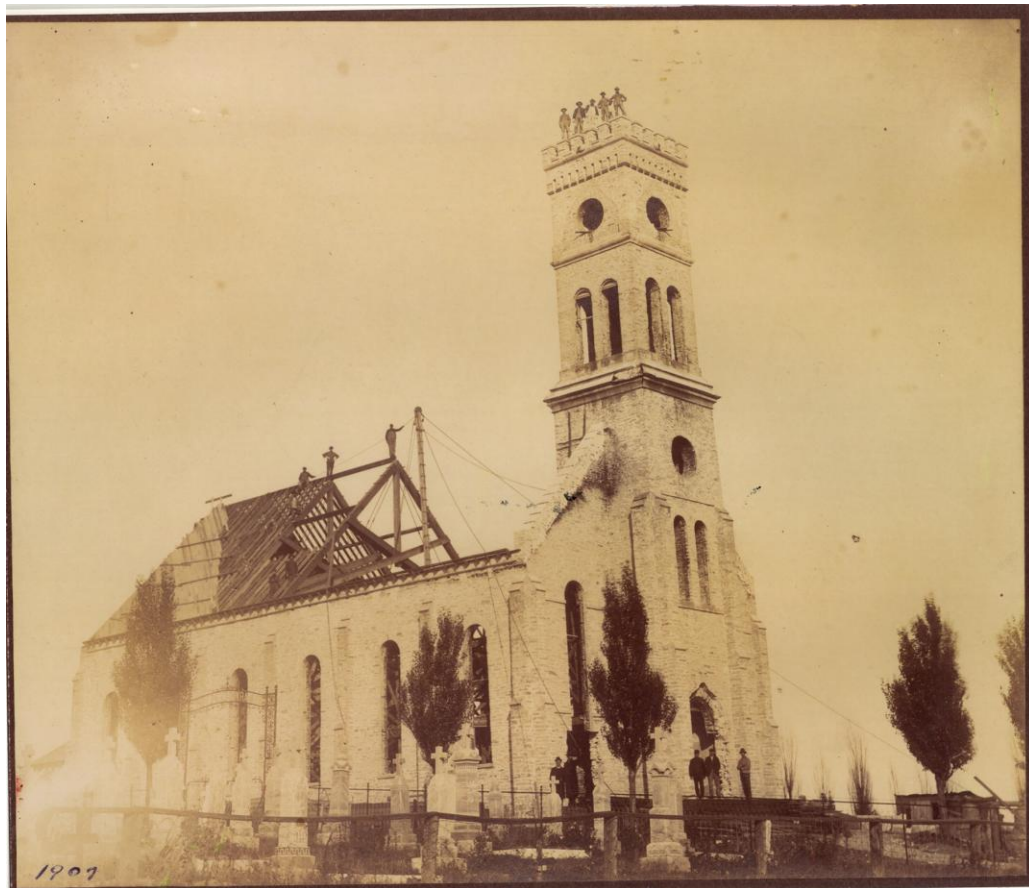
St. Mary's Church, Marytown, (During Reconstruction after 1907)